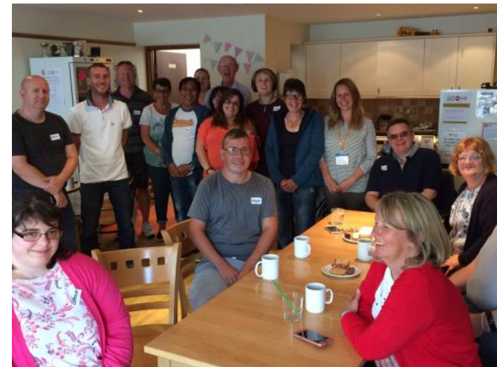
Worthing Support Group